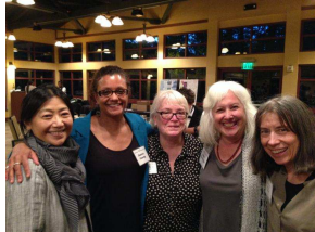
FLT at 30 Dinner Celebration